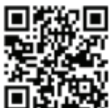
Photo sessions begin on January 28, 2025. Grab the best slots early! For more information and to sign up for your photo session, please see the parish 40th Anniversary webpage. You may also book your photo session directly, by using this QR code: